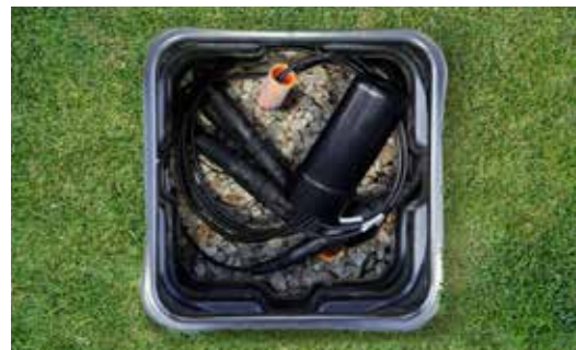
Miniature size can fit in existing handholes where space is limited (11"x11" Grade-Level Box shown)