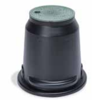
GLB610 Snap-in Cover Top Diameter: 6.0" (152.4mm) Depth: 10.0" (254.0mm) Bottom Inside Diameter: 8.5" (215.9mm)