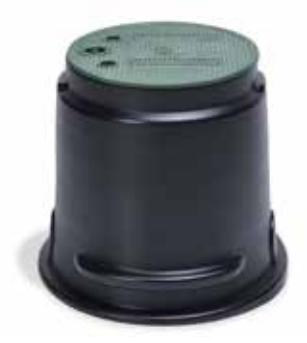
GLB912 L-Bolt Cover Top Diameter: 9.5" (241.3mm) Depth: 12.0" (304.8mm) Bottom Inside Diameter: 12.5" (317.5mm)