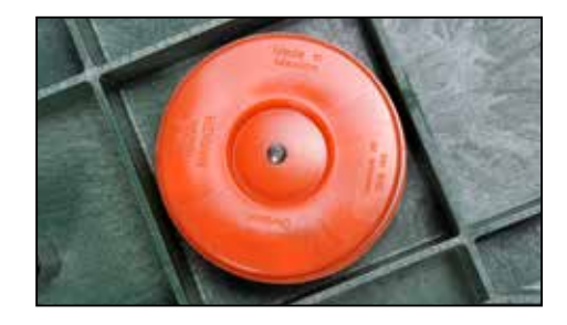
"L" Bolt Cover Security