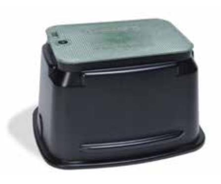
GLB1419 L-Bolt Cover Top Inside Dimensions: 10.0" Width X 15.0" Length (254.0mm X 382.0mm ) Depth: 12.0" (304.8mm) Bottom Inside Dimensions: 14.0"Width X 19.0" Length (355.6mm X 482.6mm)