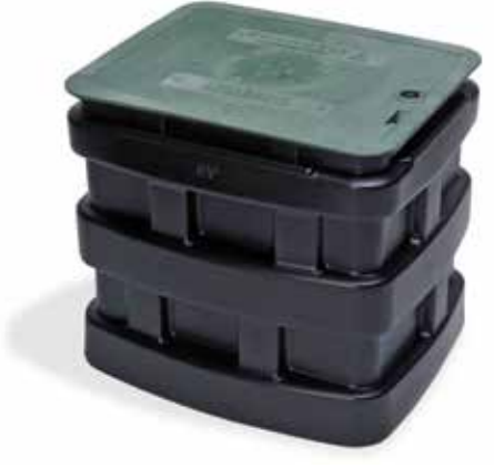
GLB1620 L-Bolt Cover Top Inside Dimensions: 16.0" Width X 20.0" Length (406.4mm X 508.0mm) Depth: 18.0" (457.2mm)