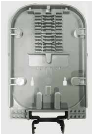
24 Fiber Tray

The Next Generation Green Hornet has been updated and advanced to simplify installation and increase capacity. The new design implements a bottom slack basket and splice trays that can be customized to the needs of the architecture. The G5N uses Channell's Universal Splice Tray to accommodate single fiber splicing, ribbon splicing, Engineered Tap/PLC splitters, and a 16-port bulkhead. Fully loaded with splice holders on each of the Universal Splice Trays 144 fibers can be single spliced inside this closure and 192 fibers if ribbon splicing is performed.