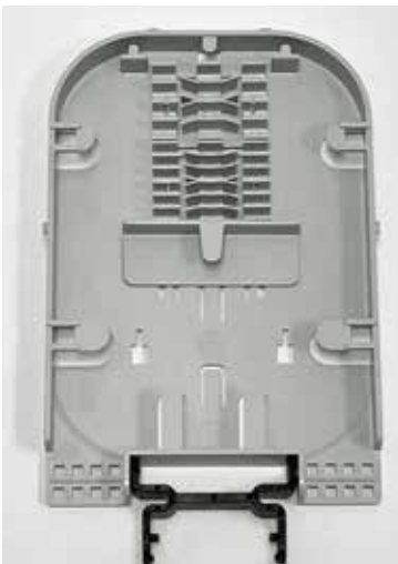
Ribbon Splice Tray