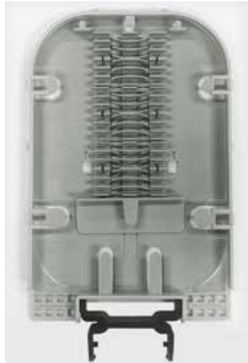
36 Fiber Tray