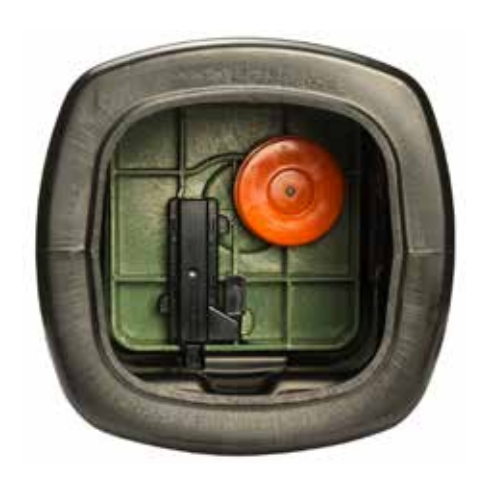
SELFLOCK closes and seals with audible "Click"