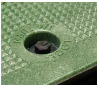
Captive bolt device opens with only 1/4 turn