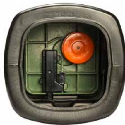
Shown with Optional Marker Locate Device