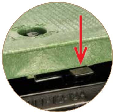
SELFLOCK™ closes and seals with audible “Click”