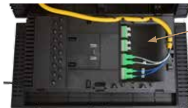
Left side drop

Bi-Directional terminal panel door allows drop connections from either side without tools, just by unsnapping and flipping the panel door.