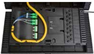
Right side drop

Left or right main cable and drop cable entry provides maximum flexibility in aerial applications and avoids the need to procure and install additional hardware.