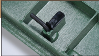
“L” Bolt Cover Security