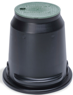
GLB610 Snap-in Cover Top Diameter: 6.0" (152.4mm) Depth: 10.0" (254.0mm) Bottom Inside Diameter: 8.5" (215.9mm)

Channell provides High Density Polyethylene (HDPE) grade level boxes and lids in a variety of depths and sizes for greenbelt applications. These boxes are designed to meet the specific fiber, coax and copper needs of the broadband, telecommunications and utilities industries. They can be used in areas of pedestrian and golf buggy traffic plus maintenance vehicle traffic in conjunction with various Channell products in below grade applications. Below Grade locators keeps the play moving and enhance the aesthetics of your surroundings.