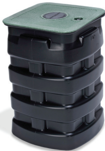
GLB1111 L-Bolt Cover Top Inside Dimensions: 11.0" Width X 11.0" Length (279.4mm X 279.4mm ) Depth: 16.0" (406.4mm)