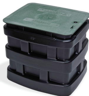
GLB1620 L-Bolt Cover Top Inside Dimensions: 16.0" Width X 20.0" Length (406.4mm X 508.0mm ) Depth: 18.0" (457.2mm)