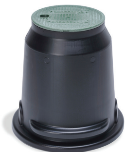
GLB610 Snap-in Cover Top Diameter: 6.0" (152.4mm) Depth: 10.0" (254.0mm) Bottom Inside Diameter: 8.5" (215.9mm)

Channell provides High Density Polyethylene (HDPE) grade level boxes and lids in a variety of depths and sizes for greenbelt applications. These boxes are designed to meet the specific fiber, coax and copper needs of the broadband, telecommunications and utilities industries. They can be used in areas of pedestrian traffic in conjunction with various Channell products in below grade applications.