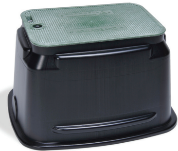
GLB1419 L-Bolt Cover Top Inside Dimensions: 10.0" Width X 15.0" Length (254.0mm X 382.0mm ) Depth: 12.0" (304.8mm) Bottom Inside Dimensions: 14.0"Width X 19.0" Length (355.6mm X 482.6mm) (Available with 6" (152.4mm) extension)