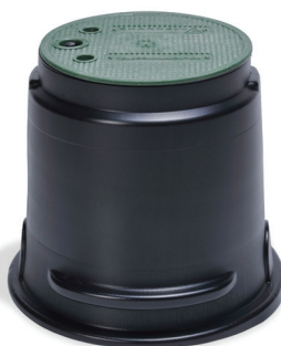
GLB912 L-Bolt Cover Top Diameter: 9.5" (241.3mm) Depth: 12.0" (304.8mm) Bottom Inside Diameter: 12.5" (317.5mm)