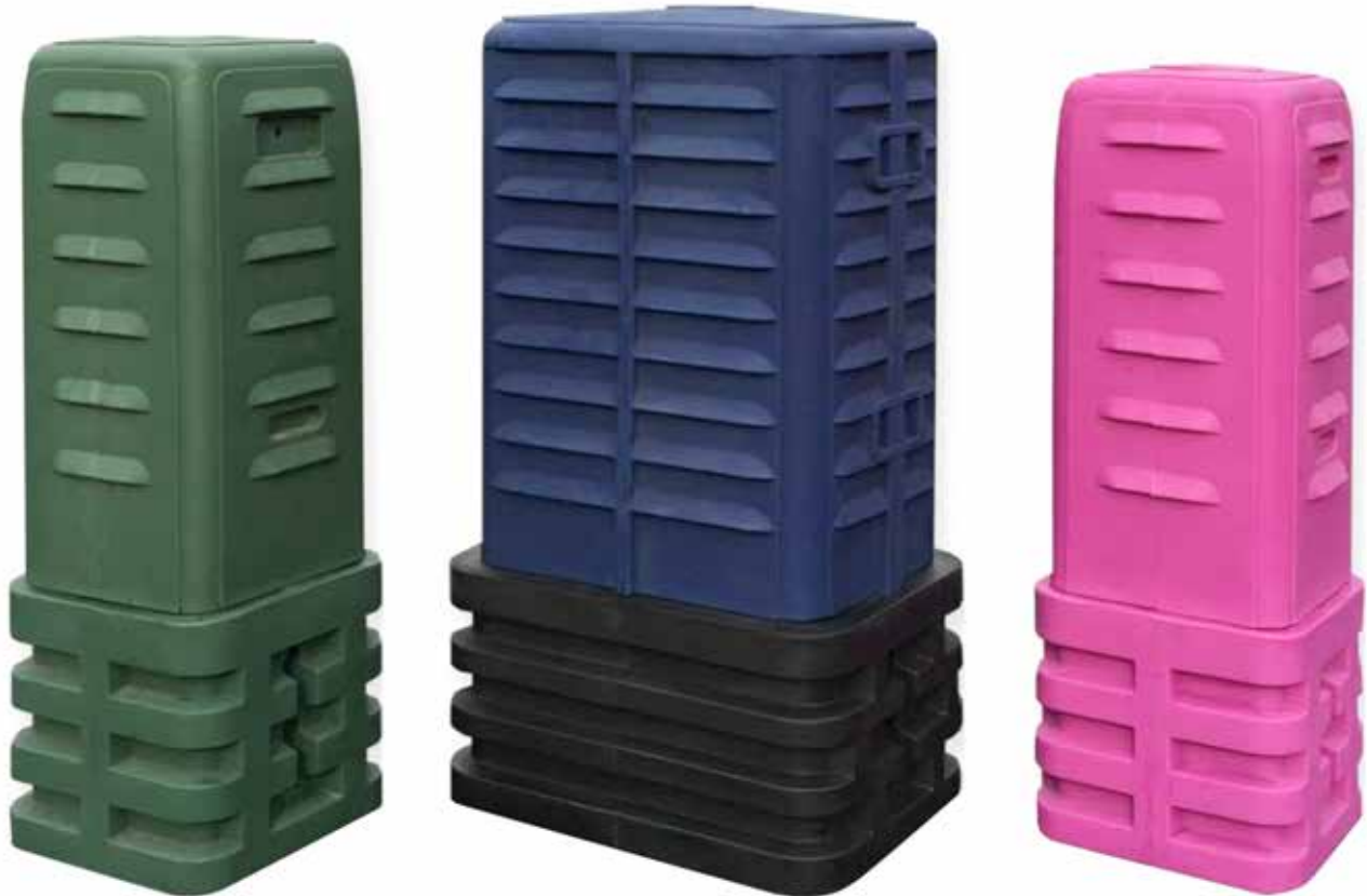
SPH1212 (Dark Green)