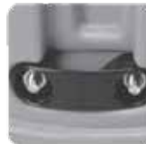
Self-locating Cover Security Lock Receiver