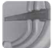
42" Joint Trench Stake (2 per ctn.) P/N ST01001

Designed specifically for housing passive equipment, these special versions of the Channell CPH911, CPH920, and CPH1022 pedestals feature direct-bury bases with a high rib design that are less likely to lean or tilt and do not require stakes for installation. A special self-locating cover ensures that the pedestals lock properly without additional alignment. The covers include Channell's Self-Lock ® security hardware.