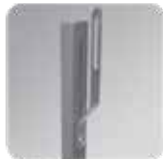
Bracket (B2 Shown)