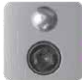
Lock (L00 Shown)