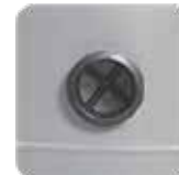
Winterized Drop (A1 Shown)