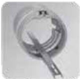
Stake (S2 Shown)