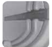
42" Joint Trench Stake (2 per ctn.) P/N ST01001

Designed specifically for housing passive equipment, these special versions of the Channell CPH911, CPH920, and CPH1022 pedestals feature direct-bury bases with a high rib design that are less likely to lean or tilt and do not require stakes for installation. A special self-locating cover ensures that the pedestals lock properly without additional alignment. The covers include Channell's Self-Lock ® security hardware.