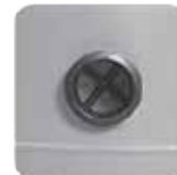
Winterized Drop (A1 Shown)