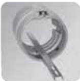
Stake (S2 Shown)