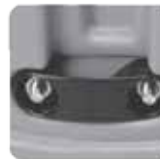
Self-locating Cover Security Lock Receiver