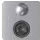
Lock (L00 Shown)