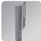
Bracket (B2 Shown)