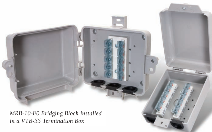
MRB-10-F0 Bridging Block installed in a VTB-55 Termination Box

Solutions for Digital Voice services cut-over and inside wire connection/management