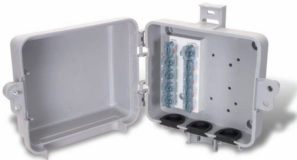
MRSB-10-F0 Bridging Block with Security System Connections installed in VSTB-55 Termination Box

Solutions for Digital Voice services cut-over and inside wire connection/management