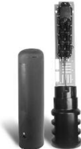
MAH8800 shown with fiber tap installed