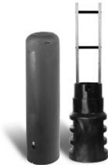
MAH8800 shown with splice ladder loop bundle support installed