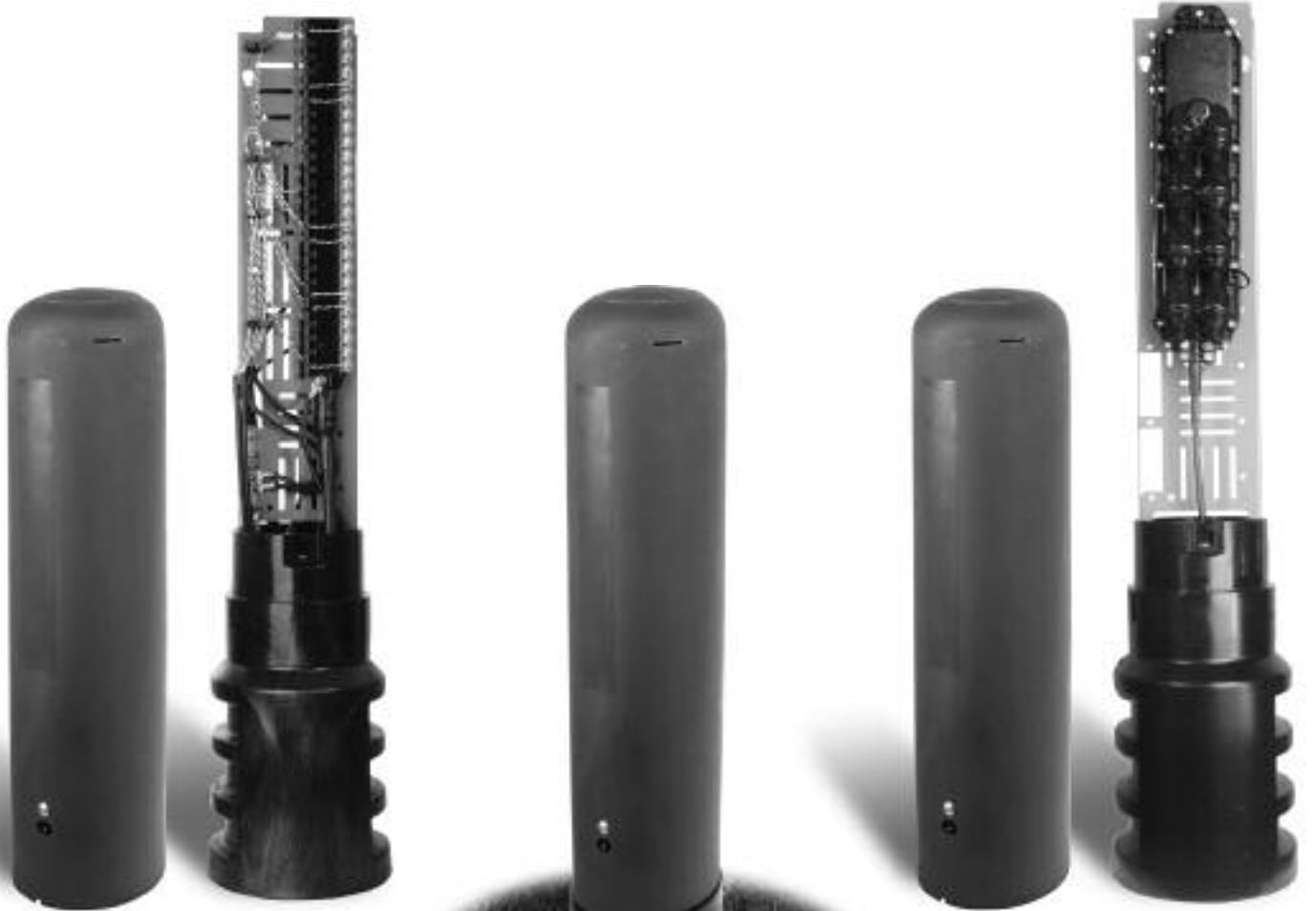
MAH8800 shown with 25-Pair Mini-Rocker® Terminal installed