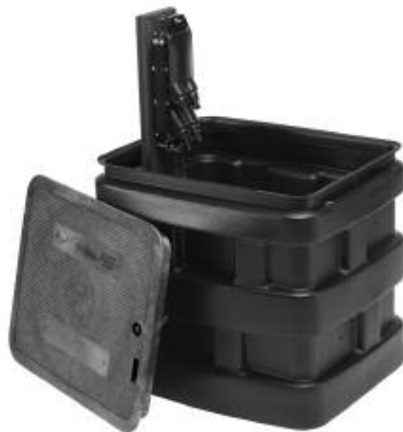
GLB1620 Grade Level Box with vertical mounting bracket installed