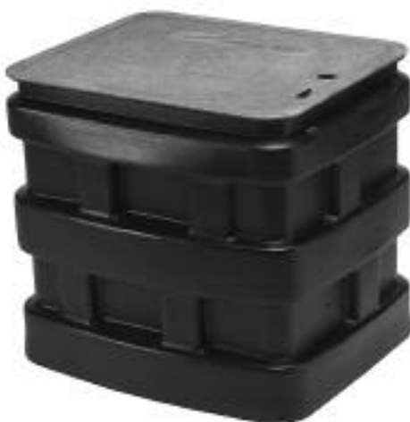
GLB1620 Grade Level Box