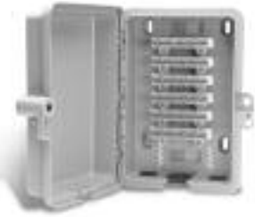
P138 Demarcation Box

4.7"H x 5.4"W x 2.4"D (119.4mm x 137.2mm x 60.9mm) 20 per carton