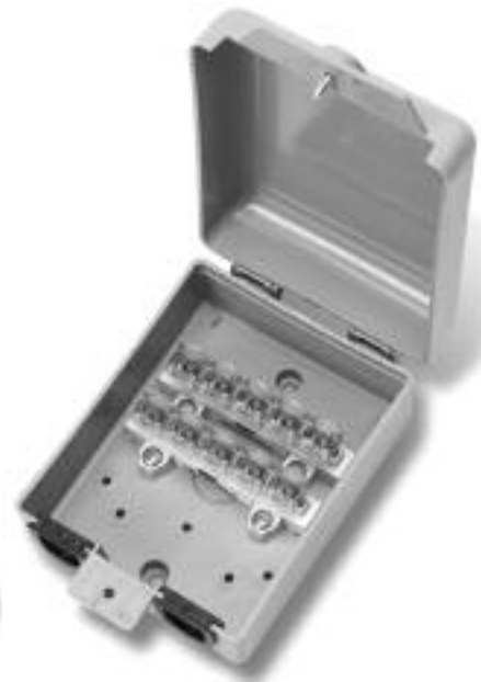
DMBP126C12L31A022 Shown with two 5-Pair Mini-Rocker Bridging Modules installed.