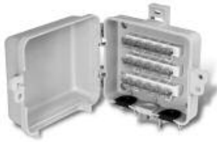
P131 Demarcation Box

5.0"H x 4.0"W x 2.0"D (127mm x 101.6mm x 50.8mm) 24 per carton