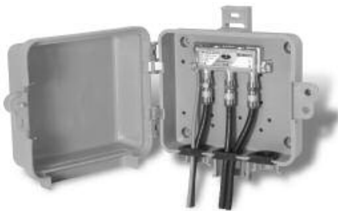
DMBP131C12L31 Shown with splitter installed (not supplied).