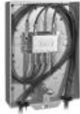
P140 Demarcation Box

10.3"H x 7.7"W x 3.1"D (261.6mm x 195.5mm x 78.7mm) 18 per carton