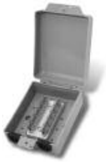
P126 Demarcation Box

5.0"H x 4.0"W x 2.0"D (127mm x 101.6mm x 50.8mm) 24 per carton